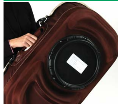
The Product Information Label is located on the bottom of the Hub